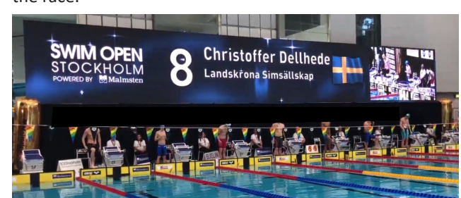
Custom Graphics for swimming event (25x3m video wall with 5200x624 pixels)

Below is an example of a wide video wall showing competition logo, lane presentation and live video just before a start. By switching combined output scene, an animation is made to reveal the scoreboard shown during the race.