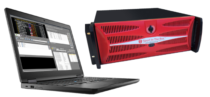
Sport In The Box Laptop & Rack Mount Computer