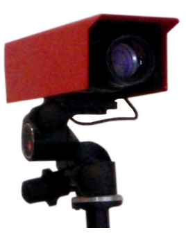
HD video camera

The system additionally features an interface to the Manual Distance Terminal by SWISS TIMING. It can also export distance data, landing pictures and even the landing sequence to different programs. All landing sequences and the corresponding athlete data are stored. One technician and one operator are necessary to run the system. FIS Ski Jumping competitions require the system operator to have a valid FIS license to measure the distance.