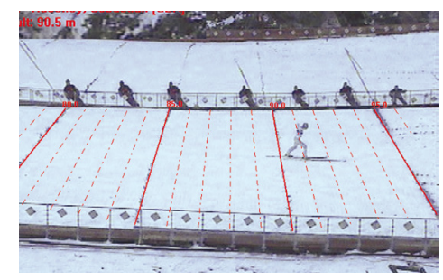
Software assisted distance measurement