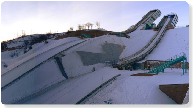
Ski Jumping Arena in Klingenthal