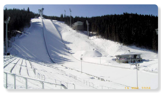
Gorney Gigant in Almaty