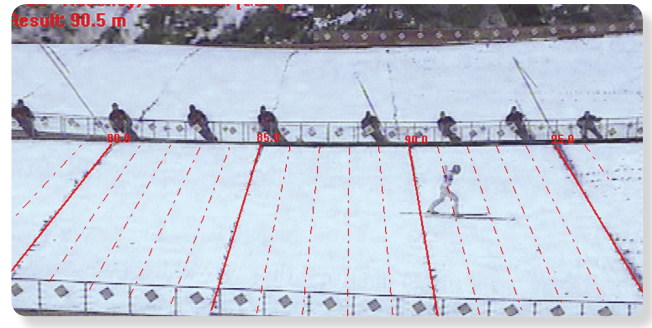
Video Distance Measurement