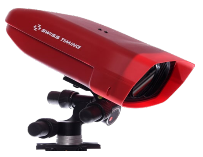
Design\ of\ Scan'O'V is ion\ MYRIA\ camera.

With optional accessories, it is possible to connect the system to peripheral devices such as scoreboards, data handling computers, wind measurements and false start control devices and HD front camera.