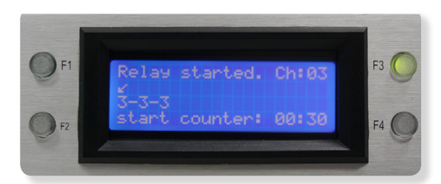
Relay Controller Interface

Basic configuration and adjustments of the relay system can be made using an independent control unit (PC). By using up to two light barrier signals close to the finishing line, the system can also generate optical and acoustic signals, thus calling the next athlete's attention to the imminent starting. Apart from being an excellent choice for upcoming relay events, the Luge Relay System is also a perfect option for just practicing sprint and reaction starts.