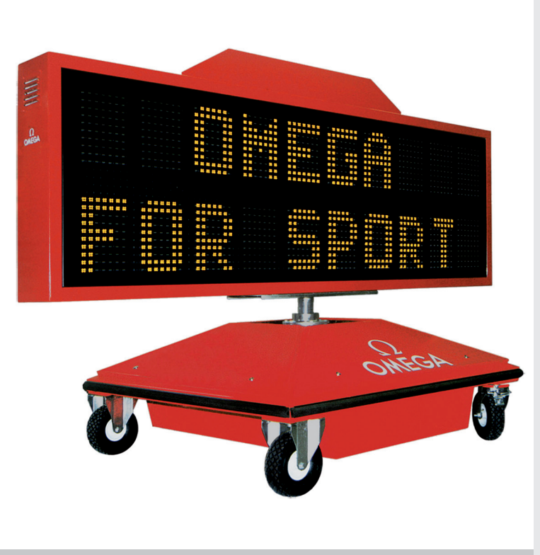
Rotating OIN4 display on its integrated mobile trolley

The OIN4 unit is a multi-use field display with two lines of ten digits. Each digit is 30 cm high, and is based on a high intensity LED matrix. OIN4 features a back-and-forth rotary motion for a 360° viewing. The OIN4 field display is the fourth and latest generation of the Omega athletics on-field boards and gathers the best features from all of the previous versions and adds the benefits of LED technology to improve quality and reliability. The OIN4 permanently displays the names of the athletes before each attempt, and shows the results once it has been measured. Depending on the software used to control the display, a variety of information can be displayed, such as: attempt number, wind speed, athletes bib number, the concentration clock, as well as free text or advertising information. OIN4 displays feature a double-sided display with a rotation of +/-45°. The display automatically adapts the brightness of the high quality amber LEDs to the ambient light conditions which makes it perfect for both indoor and outdoor use. The 30 cm characters provide a viewing distance of up to 150m.