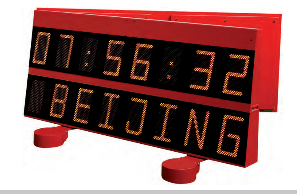
The BEST TIME display in a pair with it's foldable wheels

The BEST TIME display is the ideal information panel required on the athletic field and specially at the finish line and was specially designed to fulfill those requirements. As soon as the leading or winning athlete crosses the finish line, the time is displayed and becomes immediately visible to the other athletes, the public and the medias. Its wheels allows BEST TIME to be easily installed close to the finish line or anywhere on the field, providing excellent visibility to both the athletes and the spectators. BEST TIME units can be used in pairs. The wheels can also be folded for transport. BEST TIME features two lines of eight alphanumeric characters; amber LEDs provide excellent visibility at distances of up to 150 meters. A sensor adjusts the brightness according to the ambient light conditions. BEST TIME can be linked to any timing devices such as the CHRONOS for split times or the Scan'O'Vision photo finish camera for finish times.