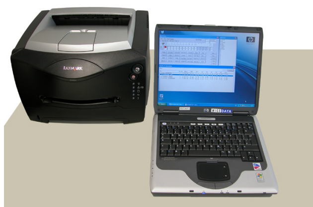
ISUCalcFS incl. Printer