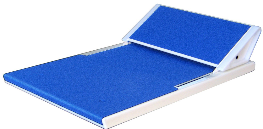
OSB 12 Starting Platform with mobile foot rest

OSB12 can be mounted or adapted to almost any type of existing starting blocks.