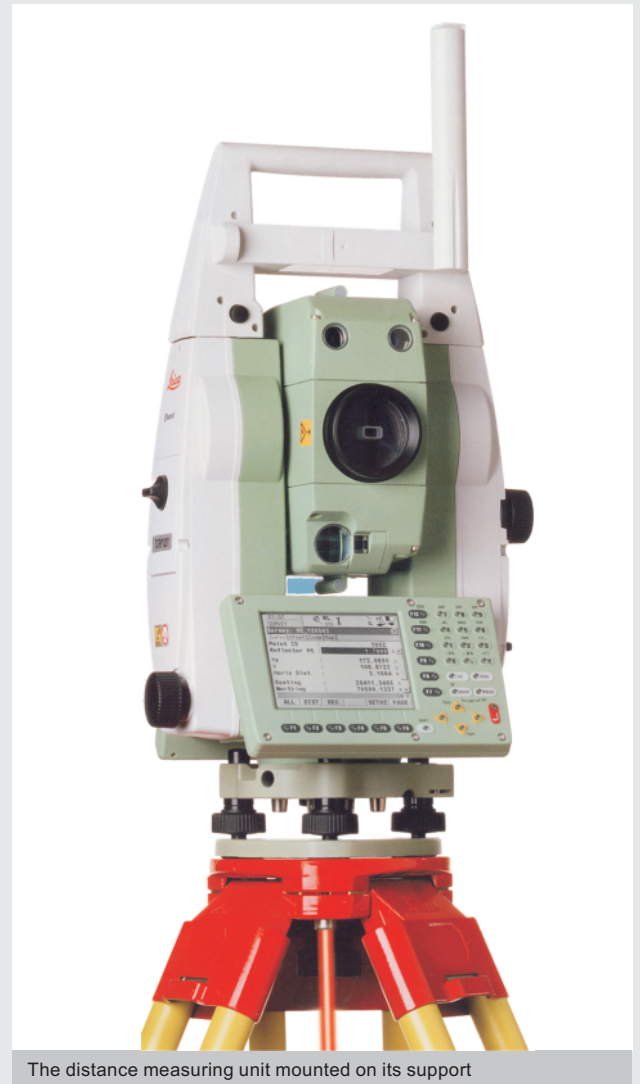
The distance measuring unit mounted on its support

Allows various distance measures, including Javelin, Discus, Hammer throws, Shot puts, Pole vault, long and triple Jump. Electronic distance measurement equipment presents many advantages: it eliminates subjective influences on the result, it features a high accuracy, it is insensitive to environmental conditions like rain, wind and lighting, and the measured results are directly transferred to the competition's computer.